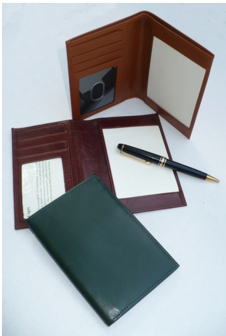
92207: Memo Wallet

An essential item for when you need to make notations where smart phones are not permitted. Also features deep currency compartment and 4 card pockets. Crafted in smooth calfskin.