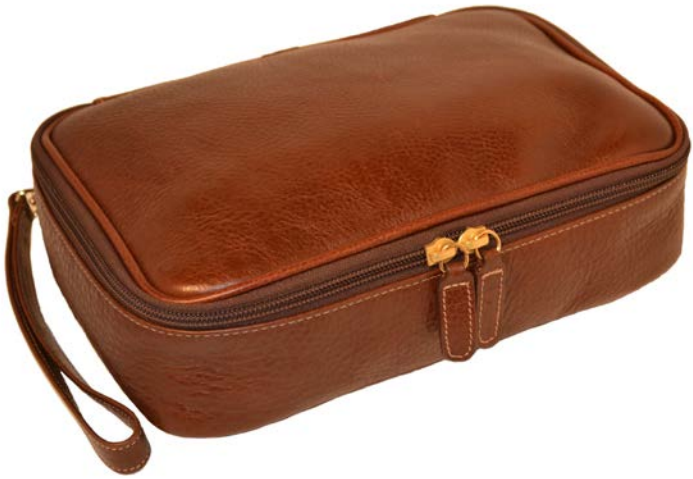
92720 : Profile Packer Shave Kit Dimensions: 10" x 6 ½" x 3" shown in Chestnut Milano Leather