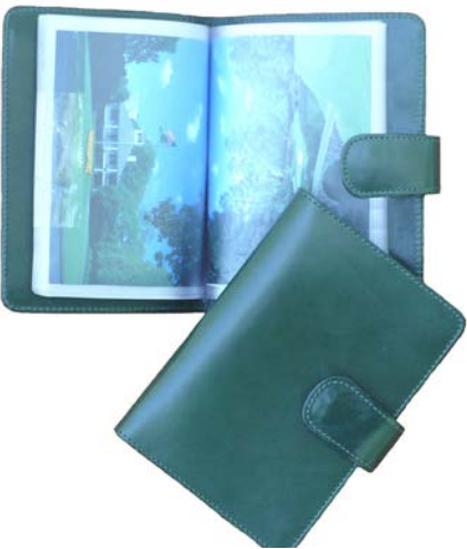
92840 : Photo Brag Book Holds 4" x 6" Photos

Holds 5" x 7" Photos back to back, either Portrait or Landscape Format.