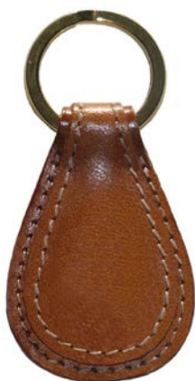
92301T: Tear Drop Overlay with Split Ring