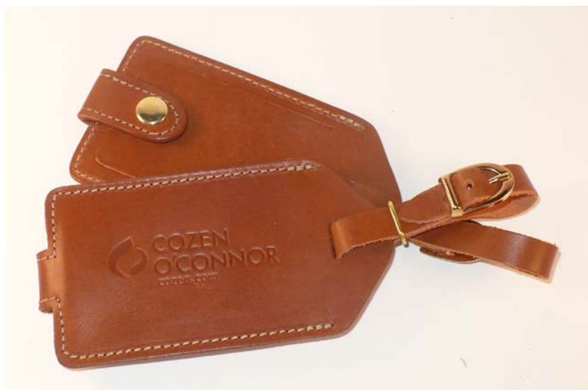
92420: Deluxe Snapdown ID Travel Tag (sized to hold business card )