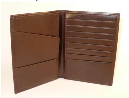
92113: Passport Wallet

Features 8 credit card pockets, leather lined currency pocket with bill divider