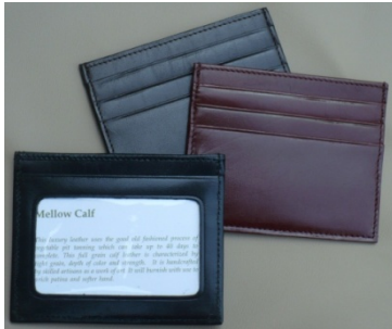
92815: Stack ID Card Case

Simple and practical card case fits neatly in your front pocket without being noticeable. Center top access to hold folded bills. Front offers 3 credit card slots, while the back offers full view ID