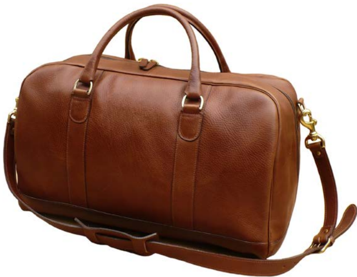
92503: Country Club Bag Dimensions: 20" x 13" x 10" Shown in Chestnut Milano Vegetable Tanned Cowhide