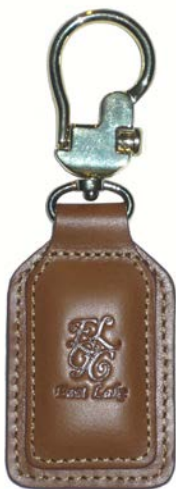
92302T: Deluxe Overlay with Pull Ring