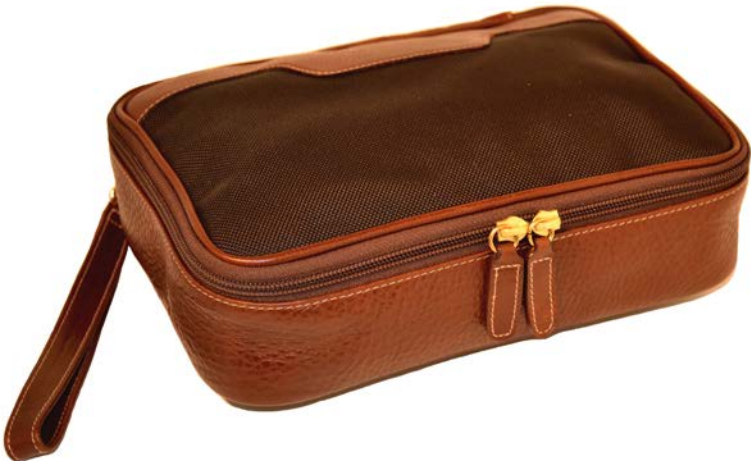
92720BAL : Profile Packer Shave Kit Dimensions: 10" x 6 ½" x 3" shown in Black Ballistic w/ Chestnut Milano