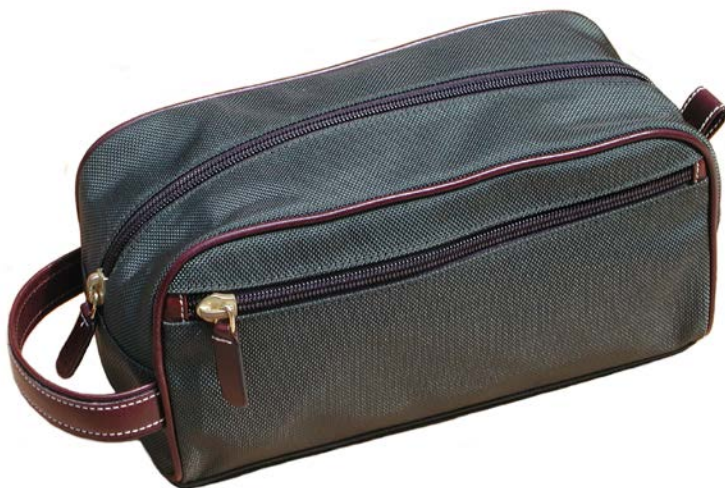
92703BAL : Classic Shave Kit shown in Green Ballistic w/ Chocolate Leather Dimensions: 11" x 5 ½" x 5"