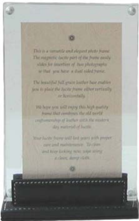
92802 : Lucite Photo Frame and Leather

Holds 5" x 7" Photos back to back, either Portrait or Landscape Format.