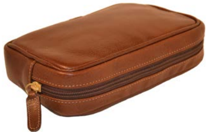
92748 : Small Personal Utility Case Dimensions: 8 1/4" x 4 3/4" x 2"

Ideal for the traveler who needs to keep the numerous electronic cables and such safe and secure. It's nylon lining also lends itself for liquids and lotions.