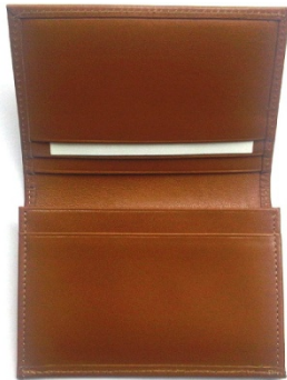
92102: Gusseted Card Case

Simple and practical card case fits neatly in your front pocket without being noticeable. Center top access to hold folded bills. Front offers 3 credit card slots, while the back offers full view ID