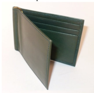
92845: Money Clip Wallet

Features 8 credit card stack with deep leather lined currency pocket. Passport file pocket and an additional card pocket .