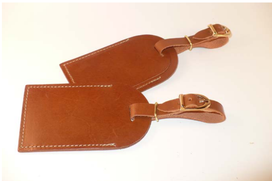
92422 : Deluxe Covered ID Travel Tag (sized to hold business card )