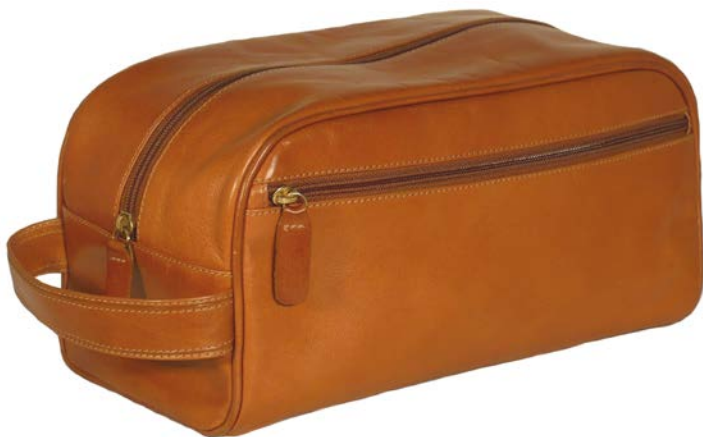
92703 : Classic Shave Kit shown in Toscana Cognac Dimensions: 11" x 5 ½" x 5"