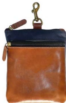
92814: Personal Pouch w/ Fleece Lining Dimensions: 6" x 7" x 5/8"

Shown above left to right: 92814, 92814ALP, 92814BAL