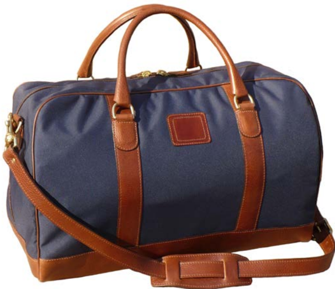
92503BAL: Country Club Bag Dimensions: 20" 13" x 10" Shown in Navy Ballistic Nylon with Chestnut Milano Leather Trim