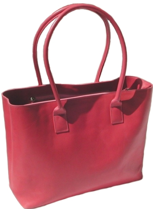
92916: Pennington Tote

A long time favorite, as it features a center zip divider pocket, as well as a zip accessory pocket and slide pockets for phone and other small items.