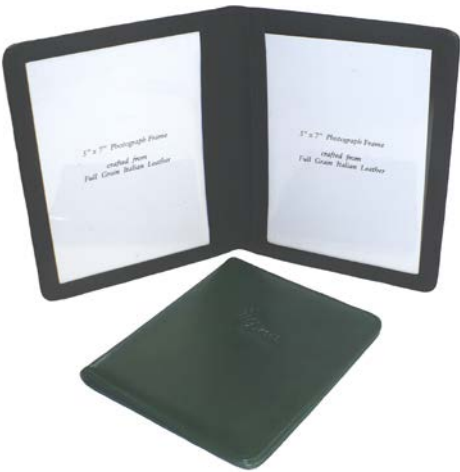
92803 : Folding Picture Frame Holds 4" x 6" Photos