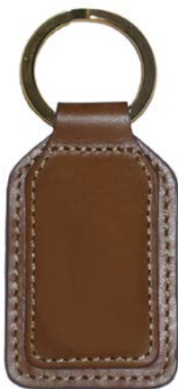
92301R: Rectangular Overlay with Split Ring