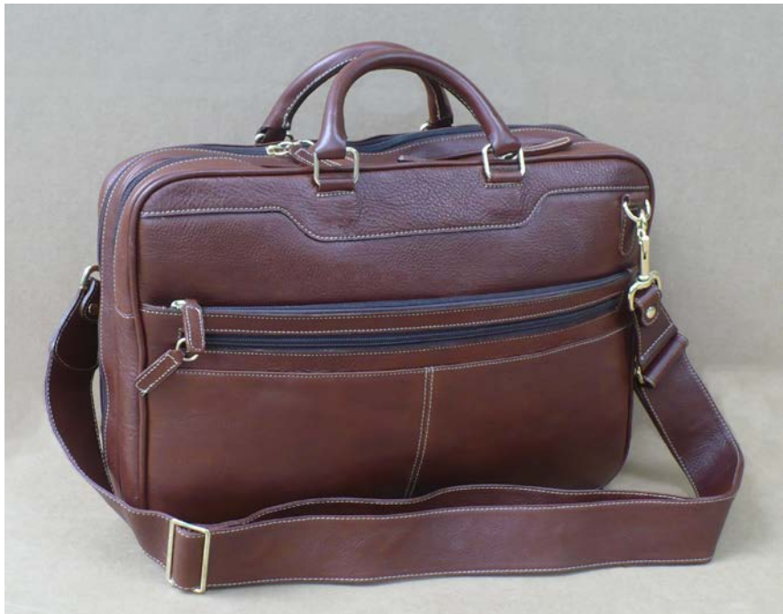
92920BAL: Chairman's Briefcase