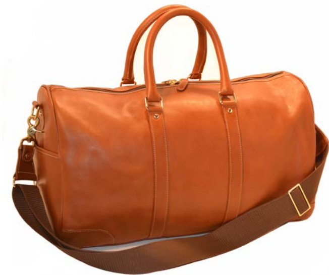
92500 : Satchel Duffel Dimensions: 19 ½" L x 10"H x 9 ½" W shown in Papaya Milano