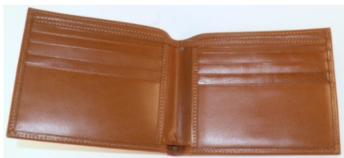
92821: Slimfold Wallet

Features 8 credit card pockets, leather lined currency pocket with bill divider