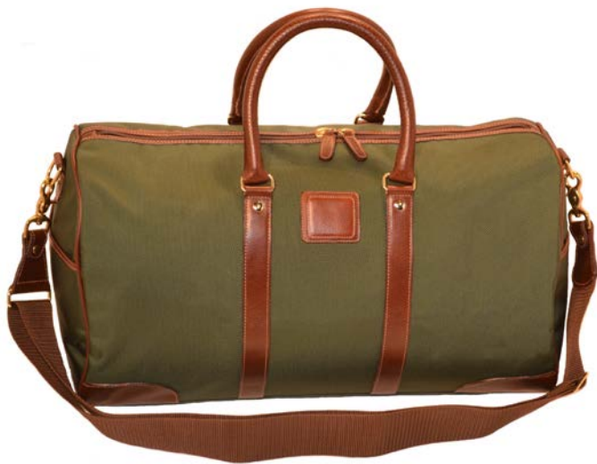
92500BAL: Satchel Duffel Dimensions: 19 ½"L x 10"H x 9 ½"W shown in Green Ballistic w/ Chestnut Milano