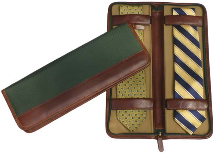
92721BAL : Tie Case Dimensions: 6" x 16 3/4" x 1 1/2"

Keep your favorite neckwear neat and secure while traveling. Each panel will hold 2 ties under leather wrapped elastic bands.